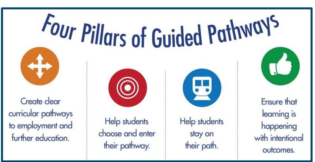
Guided Pathways at California Community Colleges

For over a decade, we've known education beyond high school is key to individual prosperity and regional economic competitiveness.<sup>6</sup> Yet despite the growing value of college credentials, college leaders have faced disinvestment and greater public scrutiny. State funding for public two-year colleges has declined, while federal accountability has increased. Philanthropic initiatives like Achieving the Dream and Completion by Design attempted to shift focus from student access to completion. Success has been limited; studies find either a tiny percentage of individuals are engaged deeply, or a large percentage are provided light-touch services that have little impact.<sup>7</sup> Across the country, fewer than 40 percent of community-college students complete any credential within six years of enrollment.<sup>8</sup>